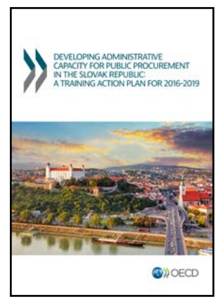
Developing Administrative Capacity for Public Procurement in the Slovak Republic

Going Green Best Practices for Sustainable Procurement