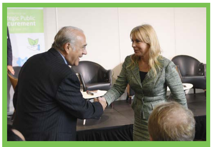
With @A_Gurrla :#EUPublicProcurement: a priority in the works of @EU_Commission and @OECD in the coming months