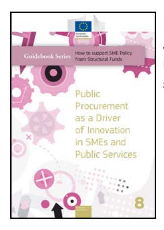
Public procurement as driver of Innovation in SMEs and Public services