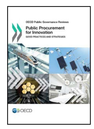
Public Procurement for Innovation Good Practices and Strategies