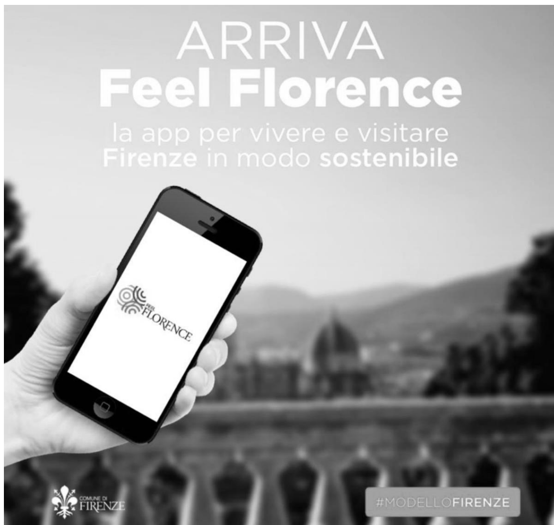
Figure 2: The Feel Florence app

The Metropolitan City of Florence has a rich cultural heritage, which has always bolstered tourism in the city, with nearly 13 million tourists per year prior to the COVID-19 pandemic. Until recently, providing tourism-related information to visitors has been a task handled independently by local authorities and major tourist centres in the city. As a result, Florence and its surroundings have been serviced by multiple databases powering different websites and mobile applications. Such a fragmented and siloed approach to information dissemination has proven challenging, because it fails to provide accurate city-wide information and manage real-time tourist flows in the city.